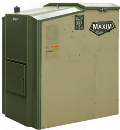
GREEN / OLIVE GRAY

Door ..... 15.5" x 13.5" Weight ..... 1310 lbs Water Capacity ..... 90 gal. Hopper Capacity .... 11 bushel (600 lb)