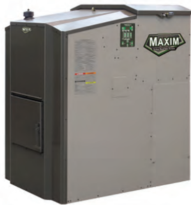
TERRA BROWN / TAUPE (textured finish)